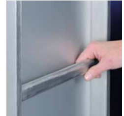
+ Ergonomic push handles on both face sides of the unit