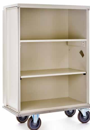
RG 230H with 2 shelves