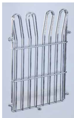
DIN A4 frame for papers CBZ083