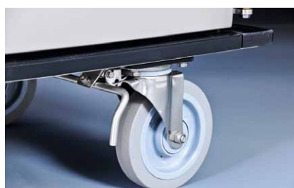
Directional lock RGEE-Rifix