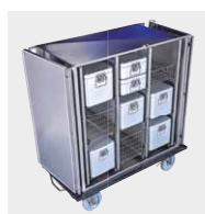
Height adjustable slides CES60T for sterile containers