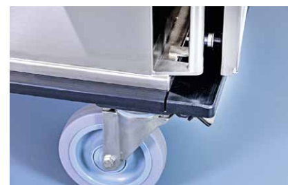
Magnet for door fixation in washing tunnel at 260° RGEE AR260V