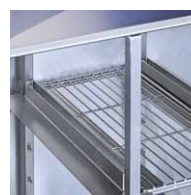
Wire shelf CES60DF