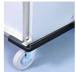
+ Stainless steel carriage with wrap-around polymer bumper (PE)