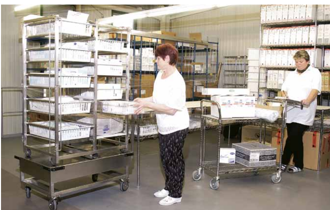
AGV shuttle unit in consignment