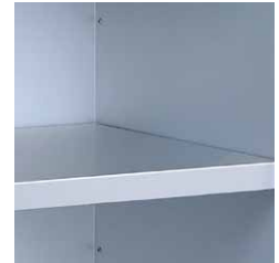
+ Shelves hygienic spaced mounted