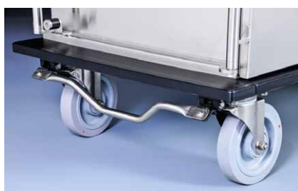
Central locking bar RGEE-Z-Stop