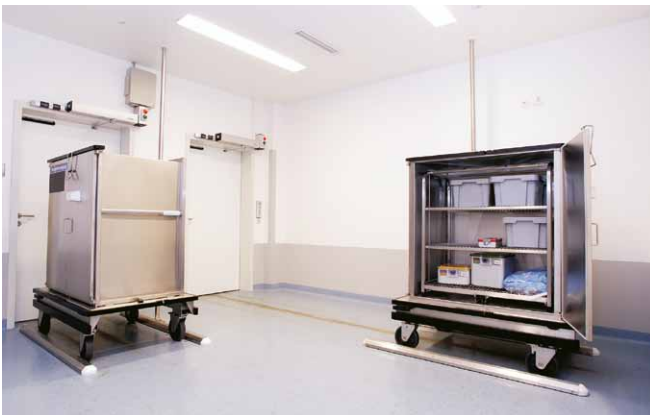
Outgoing goods in the sterilization center