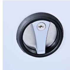
+ Doors with central lock, lockable