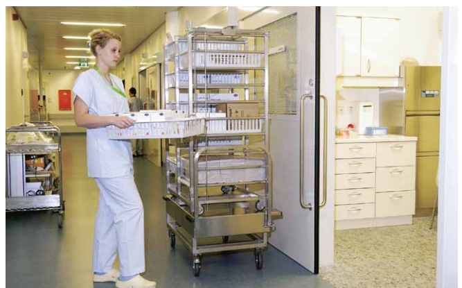
AGV shuttle unit during distribution at the ward