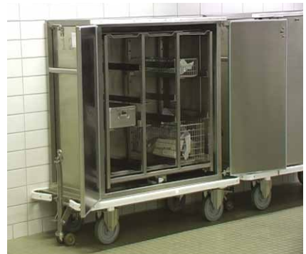
... with all-wheel steering and maneuvering casters

„Manufactured in accordance with your specifications! It may be right for many purposes, but not for every one. That's why we also offer you individual solutions if required.“