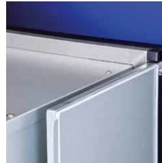
+ Rubber sealing around the door