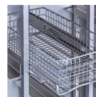
Extension frame for STE baskets and containers CES60AZ2

Technical constructions and alternative casters see page 88!