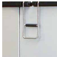
2-point locking system