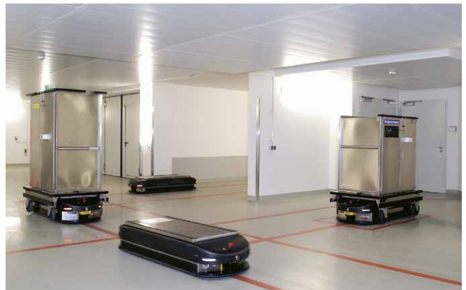
AGV transport units are routed automatically to their destination