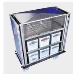
Shelves on height adjustable slides CES60T , Height grid 75 mm

Technical constructions and alternative casters see page 88!