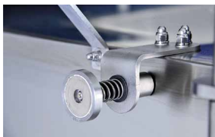
Magnet for door fixation in washing tunnel at 270° and 260° RGEE AR 260U