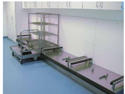
Sterile goods store with elements of Hammerlit Shuttle systems