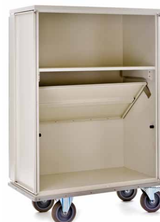
Lower shelf hinged upwards