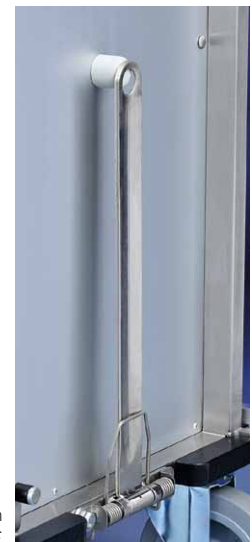
Joint and hitch KDRGAE