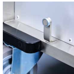
+ Magnet fixation of doors