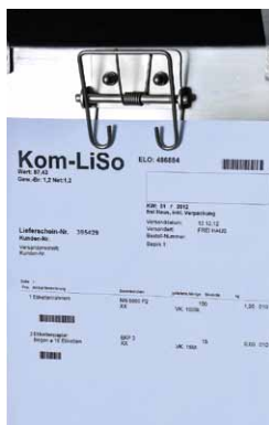
Clamp for papers RGEE KL