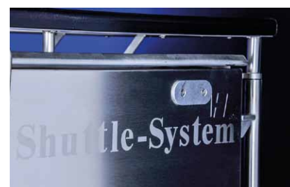
Washing tunnel-resistant labelling as per customer specifications