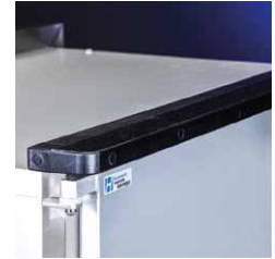
+ Polymer front bumper