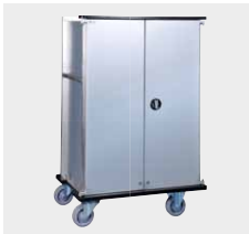
RGAE 320MTR closed

! The light weight cart RGAE is designed for transport of trays in ISO format 40/60. Secure transport is ensured by stainless steel insert frame with welded U-profile rails. Polymer liners are available on request.