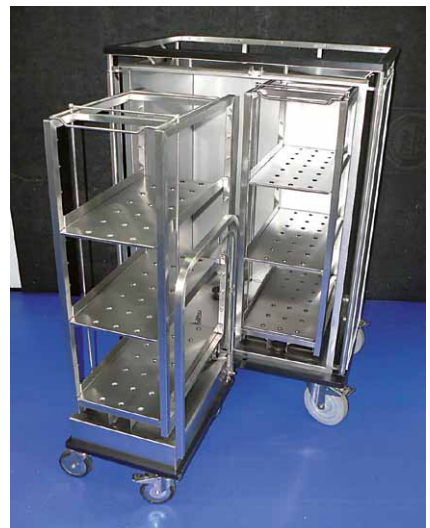
Shuttle system, insert tray and perforated metal shelves