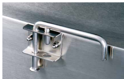
Fold-down bow for door fixation in washing tunnel at 260° RGEE AR260