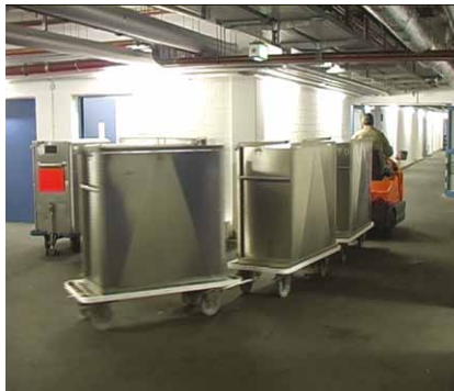
... with all-wheel steering for optimum control