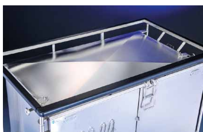
Upper bumper for off-site transport by truck RGEEUOA