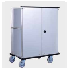
RGAE 250 closed