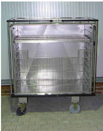
AWT containers with universal wire mesh shelves