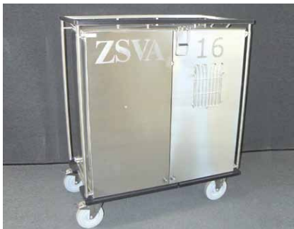
Individual inscriptions applied by the glass bead process