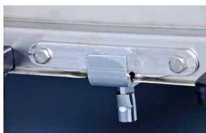
Joint and hitch KD RGEE