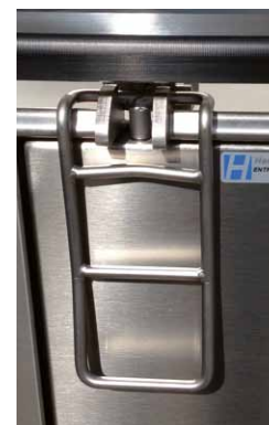
Catch bolt for added door security, meets the specifications of M232 Catch-bolt RGEE