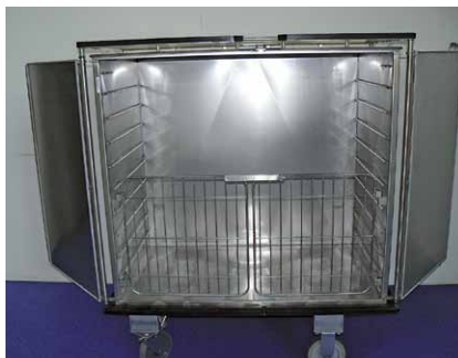
AWT containers with inner doors