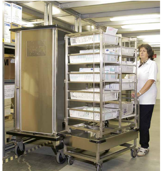
AGV transport cart during assembly at the central store in combination with the Hammerlit-Shuttle-System. Pictures taken at the university hospital in Leipzig, Germany