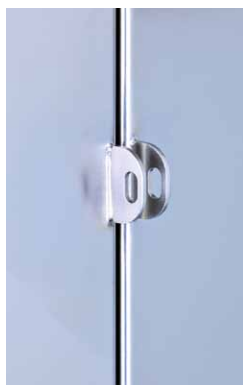
Eyelets for seals RGEE PL