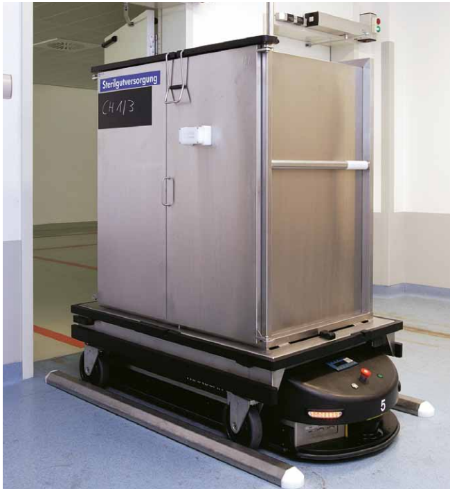
AGV transport cart is collected automatically

Hammerlit is your ideal partner if you are looking for transport carts for Automated Guided Vehicle systems (AGV systems). Whatever the application – whether transport of sterile goods, laundry or waste, ISO-Trays or special containers – we offer customized AGV-compatible solutions.