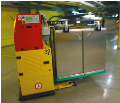
Hammerlit AWT containers